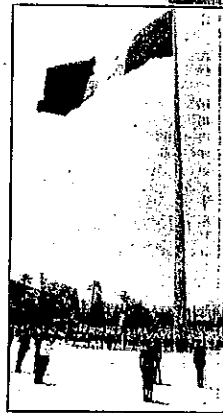
The giant flag at military's Cuartel General.

It is time to put this approach to work in San Diego-Tijuana. Already there are steps in the right direction: international art festivals like InSite '97 that celebrate public art at the border (it would be nice if some of the InSite installations could be made permanent); a movement in Tijuana to upgrade the city's image, as for example, in painting colorful murals under bridges and freeway overpasses; well-designed buildings like the Centro Cultural de Tijuana, a globe-shaped, earth-touted architectural signature on Tijuana's landscape. San Diego can make an important contribution, too. Elevate "design" to a higher priority in planning along the boundary line, and in landmark public structures (like the downtown library) that will enhance the image of the region.